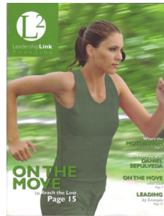
LeadershipLink Magazine and supplements