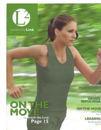
AWM Leadership Link 2010-2011